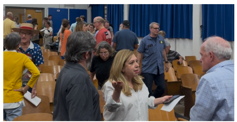
Neighbors gather at a MPUM Neighborhood Association meeting in October

e is a lot of interest in bringing the Extended Neighborhood ol program, which needs to be aged independently from the to avoid liability issues. There separate account, and funding indled outside of the NA dues. SC ENP task group plans to t with the Board, those who managed the program in the and dedicated neighbors want to help in the future. The is to relaunch later this year. e info to come!