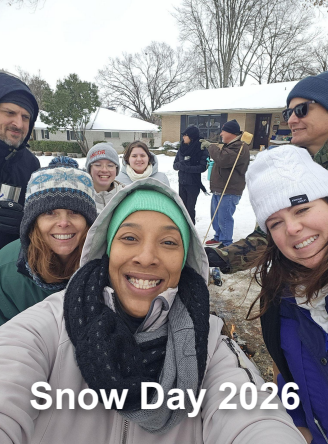
Snow Day 2026