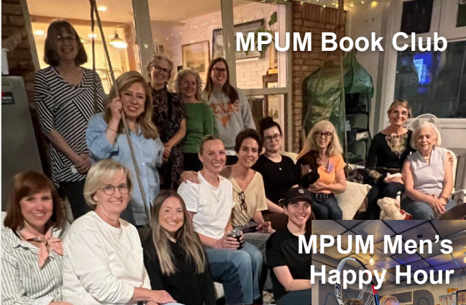
MPUM Book Club