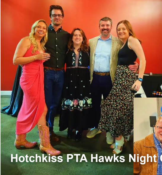
Hotchkiss PTA Hawks Night Out