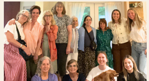
Members of the MPUM Book Club meet on the first Tuesday of every month. Want to join? Check out the "MPUM Book Club" group in WhatsApp.