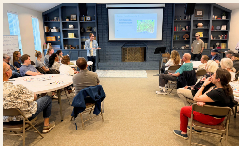
Over 50 neighbors gather at the MPUMNA All-Neighborhood Meeting on May 7 at White Rock Fellowship Church for a 2025 year in review, Board elections, Wildlife Investigator demo, and more.