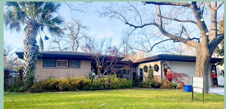
DEC 2025: Jeff Place & Erwin Latief at 7329 Wild Valley