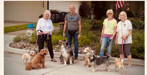
Dog friends Ruby, Drummer, Jojo, Lulu, Dolly Parton, & Daisy out for a stroll with their humans.